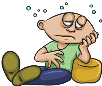
Weak or tired