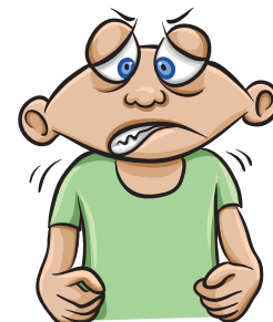
Nervous or upset

If low blood sugar is not treated, it can become severe and cause you to pass out. If low blood sugar is a problem for you, talk to your doctor or diabetes care team.